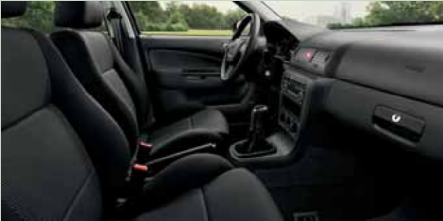
Graham Onyx interior