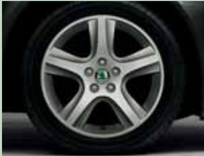
6.5J x 16" Knife alloy wheels for 205/55 R16 tyres