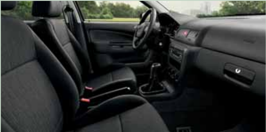
Eminent Onyx interior