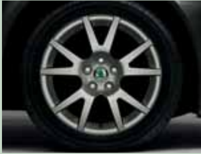
6.5J x 16" Spider alloy wheels for 205/55 R16 tyres (part of the sports package)