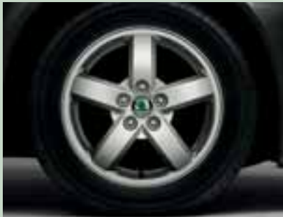
6.0J x 15" Triton alloy wheels for 195/65 R15 tyres