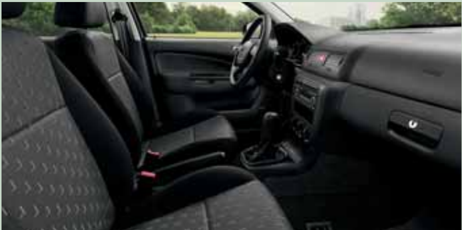
Scale Grey interior