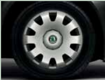
6.0J x 15" steel wheels for 195/65 R15 tyres with Drive hub covers