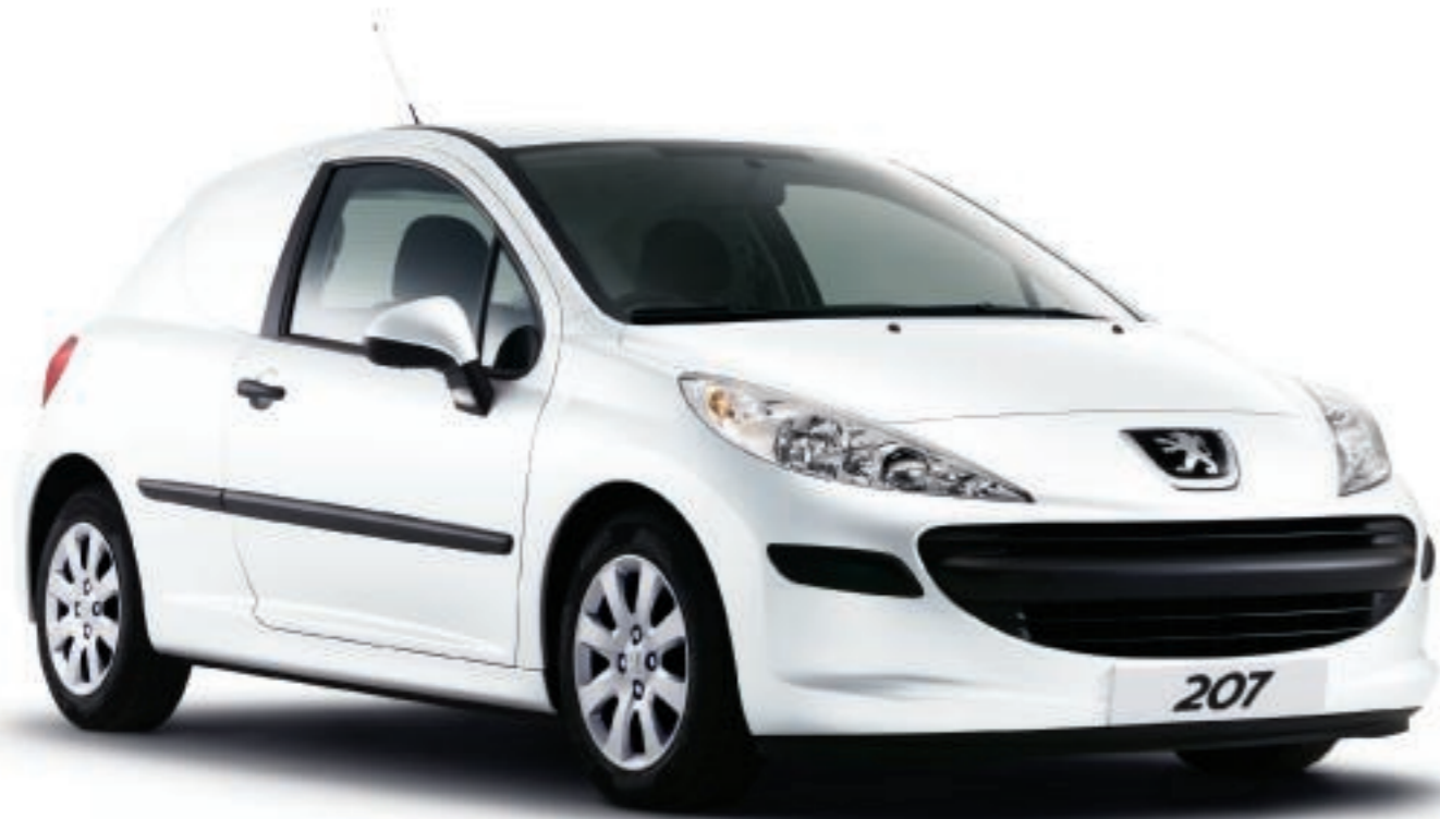
Model shown: 207 1.6 HDi with Hobart wheel trims

Put the 207 Van on your workforce, and we think you'll be seriously impressed. One look at its clean profile, dynamic lines and strong, iconically Peugeot front grille instantly tells you it means business. Get behind the wheel and you'll