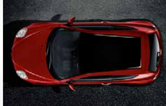
Black painted roof