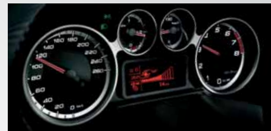
On board sports instrument with white light (Veloce)