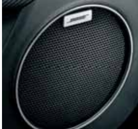
Hi-fi Bose *sound system

(1) (2) On Alfa MiTo Turismo must be ordered with opt 320/709 radio controls on steering wheel. Price does not include cost of this option.