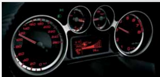
On-board instrument with red light (Turismo/Lusso