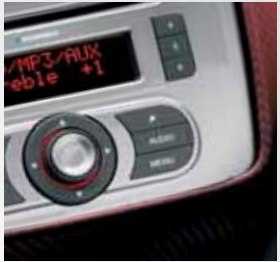
Radio system RDS with CD/mp3 player + 8 speakers + subwoofer + auxiliary amplifier