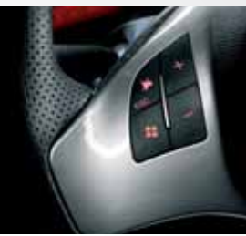
Radio/mobile phone controls on steering wheel