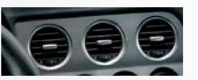
Aluminium trim inserts