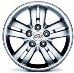
16-INCH SE/LIMITED ALLOY WHEEL