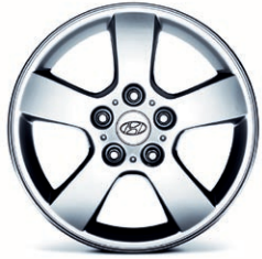
16-INCH GLS ALLOY WHEEL